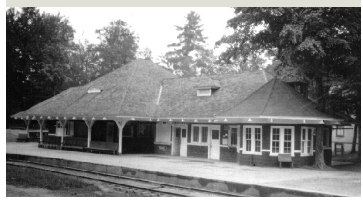
Sacandaga Station west-side in 1928

We are restoring the old Sacandaga Park Railroad Station and developing the surrounding 10 acres that are part of the former core of the Fonda-Johnstown-Gloversville (FJ&G) railroad property. We are doing this guided by the longterm goals of historic preservation and responsible economic development inside the Adirondack Park.